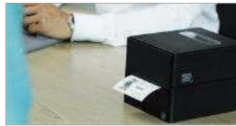
Badge Printing ( Cleared )