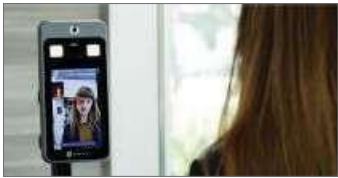
Face Mask Detection ( Failed )