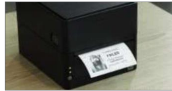
Badge Printing ( Failed )