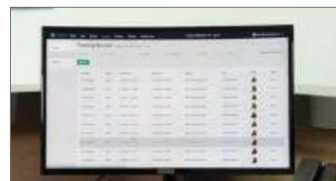
AI Platform (Contact Tracing)