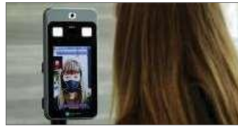
Temperature Screening ( Failed )