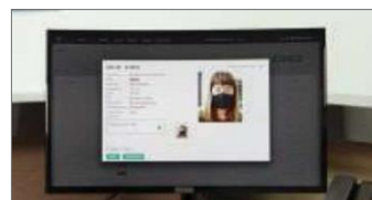
AI Platform (Review Alert Details)