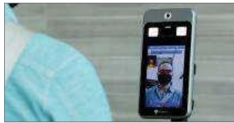
Temperature Screening ( Passed )