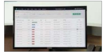
AI Platform ( High Temp Alert )