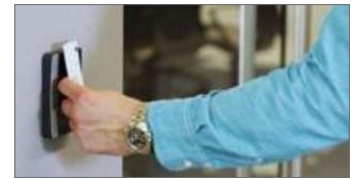
HID Reader ( Accessed )