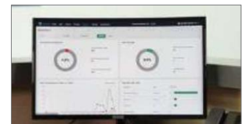
AI Platform (Dashboard Reporting)