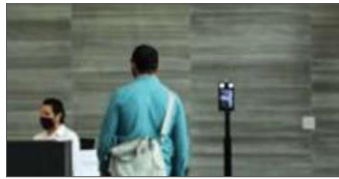
Enter Work Facility