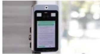
Touchscreen Health Questionnaire